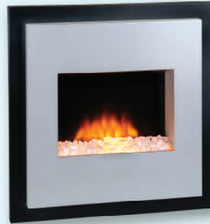
Nitra SILVER ON BLACK MODEL 155SBK WITH ICE