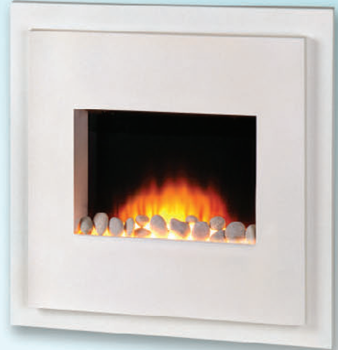
Nitra LIMESTONE MODEL 155LIM WITH PEBBLES

Wall Hanging Covers are 592mm wide x 592mm high