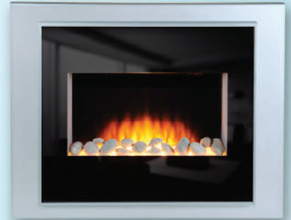
Mercura BLACK MIRROR MODEL 160BM WITH PEBBLES