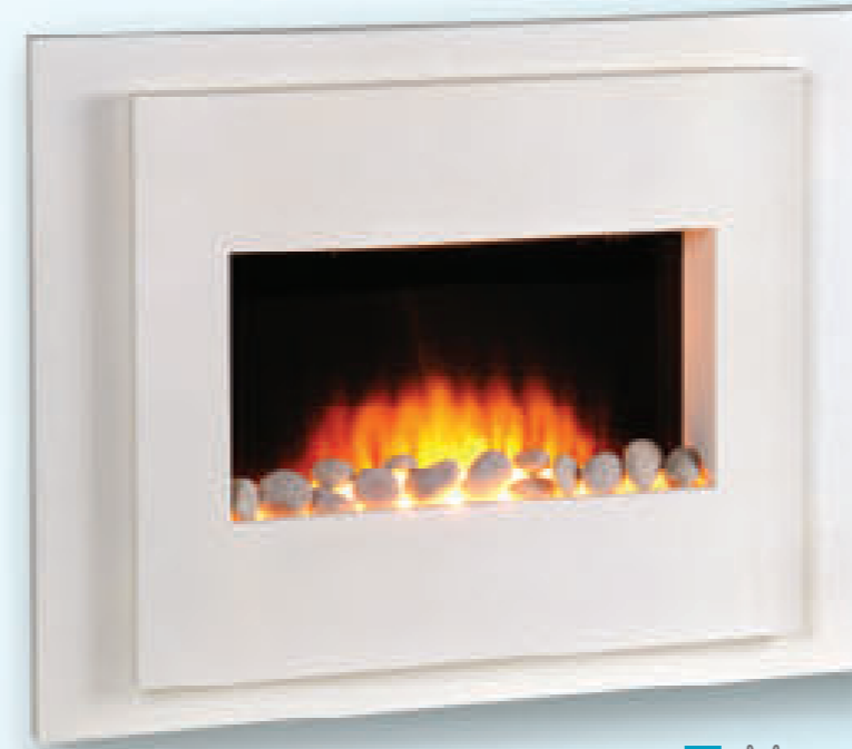
Mercura LIMESTONE MODEL 160LIM WITH PEBBLES