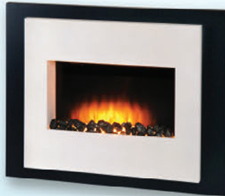
Mercura LIMESTONE ON BLACK MODEL 160LBL WITH COAL