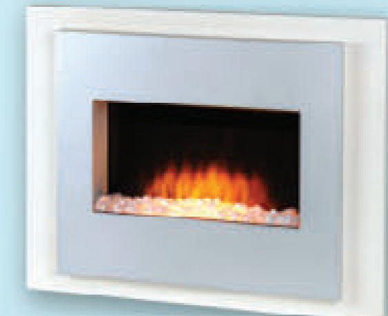
Mercura SILVER ON LIMESTONE MODEL 160SLS WITH ICE

Wall Hanging Covers are 650mm wide x 565mm high