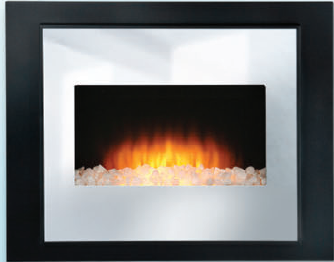
Mercura SILVER MIRROR 160SMI WITH ICE