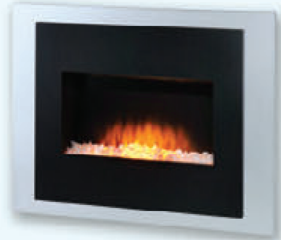
Mercura BLACK ON SILVER MODEL 160BSI WITH ICE